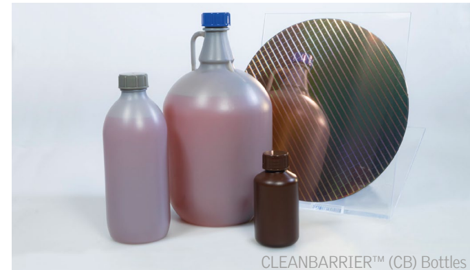
CLEANBARRIER™ (CB) Bottles