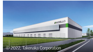
New SOLUBLON factory

Part of that growing success for the company has been its water